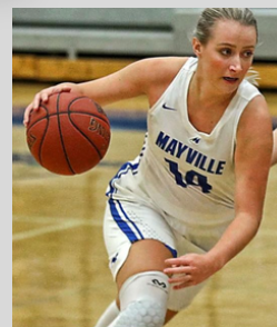
ATTACK THE RACK